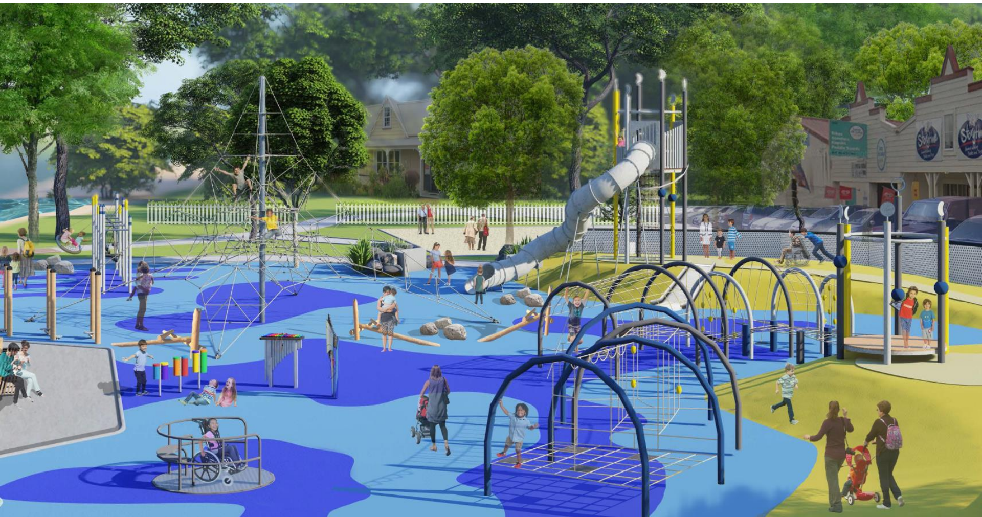
Town Basin Playground Design: view towards Reyburn House